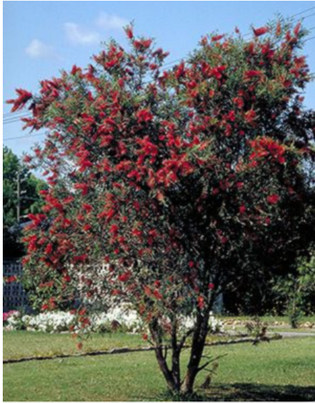
Callistemon 'Dawson River Weeper'