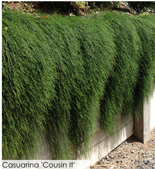
Casuarina 'Cousin It'